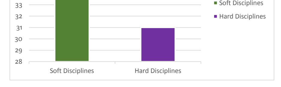
Figure 2 Mean Scores Obtained On The Perception Regarding The Feasibility Of Using Mentoring In Higher Education Institutions (HEIs) Based On The Academic Disciplines Of The Teachers.